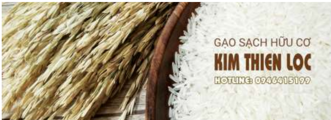
Many of local products are available in the international market

Clearly defining trade promotion as an important step in the OCOP cycle in order to bring products to consumers and make OCOP products the typical brand of each region and locality, the Center has focused on boosting the marketing and trade promotion of key and typical products of the province with a variety of activities, through domestic and international fairs and