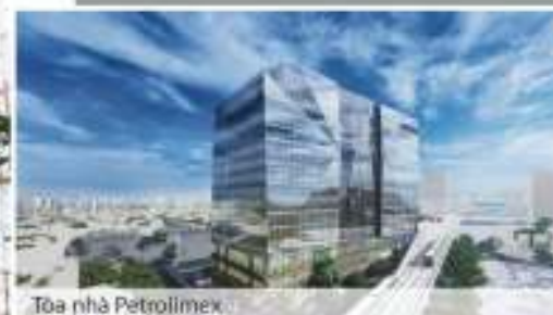
Tòa nhà Petrolimex