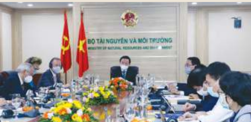
Minister of Natural Resources and Environment Tran Hong Ha (M) at the workshop on the outcomes of COP26

The British Embassy, the Ministry of Natural Resources and Environment and the United Nations Development Program (UNDP) recently co-organized a workshop to announce the results of the 26th Conference of the Parties to the United Nations Framework Convention on Climate Change (COP26) held in Glasgow, the UK.