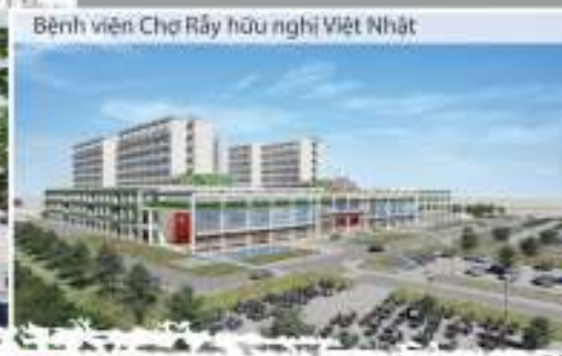
Bệnh viện Chợ Rẫy hữu nghị Việt Nhật