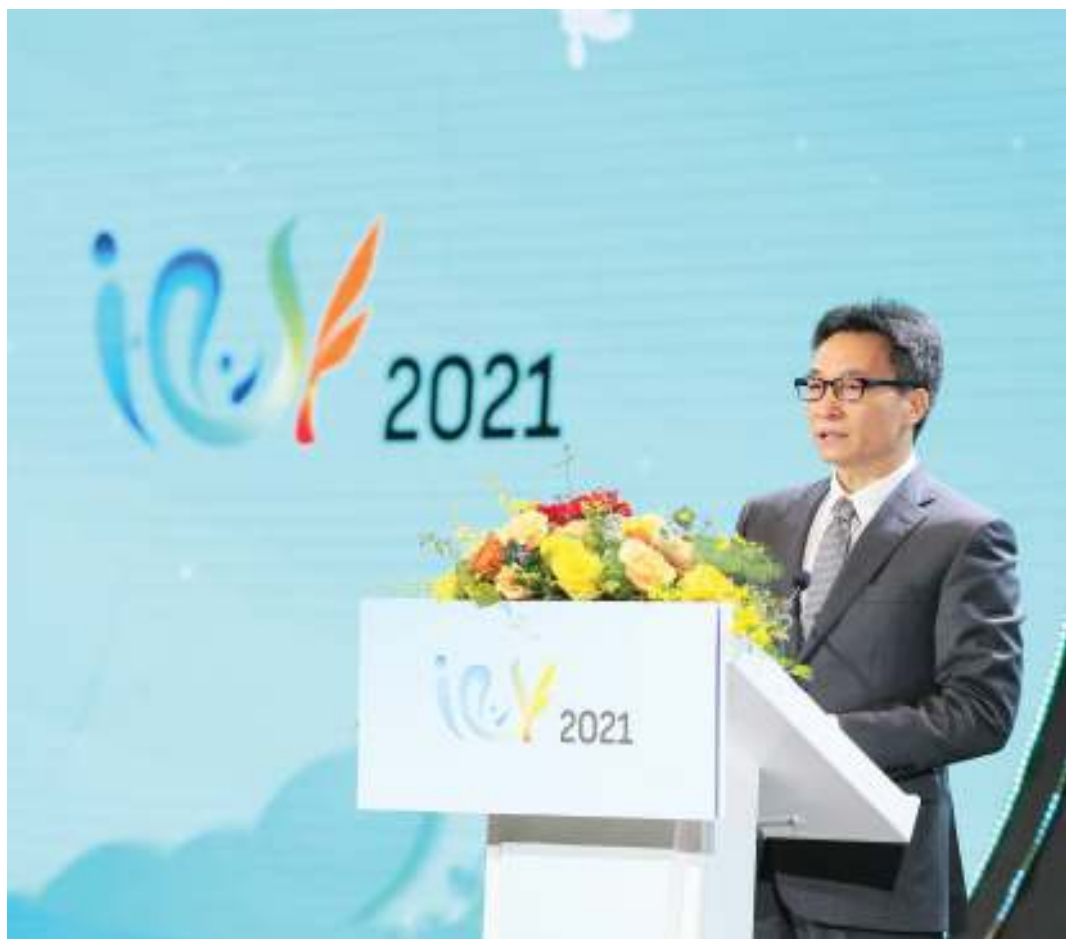
Deputy Prime Minister Vu Duc Dam addresses the Vietnam Corporate Sustainability Forum 2021

The 6th announcement of Vietnamese sustainable enterprises in 2021 shows that the percentage of