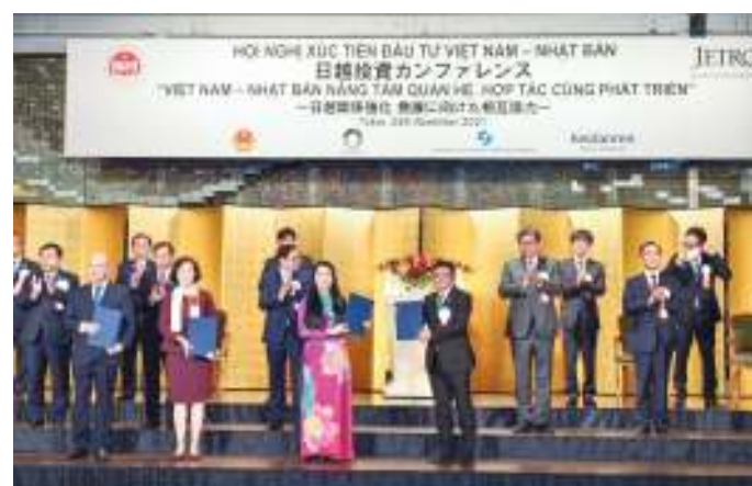
Vinh Phuc Provincial Secretary Hoang Thi Thuy Lan exchanges the MoU with SOJITZ Group and its investment partners in Vietnam

The project includes the following components: Investment in livestock farming and beef processing and distribution for the domestic market and for export, which will help boost agricultural development cooperation between Vietnam and Japan in general and between Vinh Phuc and Japanese enterprises in particular. The project also connects business cooperation of the two countries from technical cooperation, research and infrastructure development to joint venture and direct investment in high-tech agriculture. This project also included agricultural tourism. ■