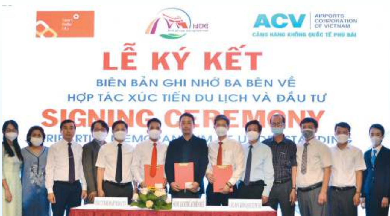
The Department of Tourism of Thua Thien Hue province, Smart Media City Co., Ltd, Phu Bai International Airport sign an MoU on cooperation in local tourism and investment promotion

giant FDI projects included Thua Thien Hue Software and Information Technology Park (Smart Media City) in Section B - An Van Duong New Urban Area invested by a joint venture between SMC Hue Co., Ltd and Korea Land and Housing Corporation (LH), and a current transformer manufacturing project (China).