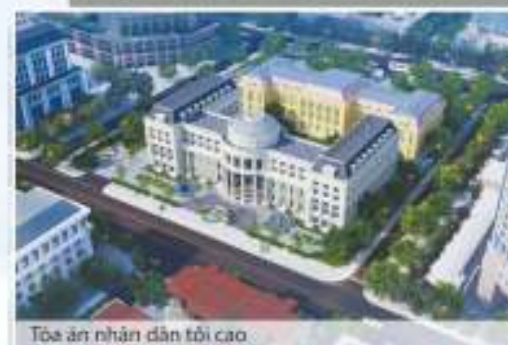
Tòa án nhân dân tối cao