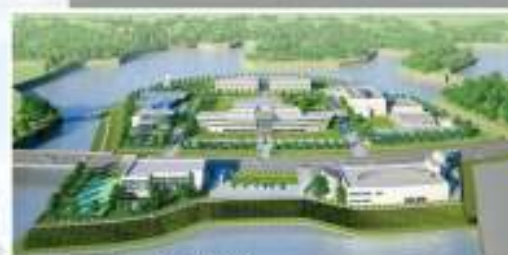
Trung tâm vũ trụ Việt Nam