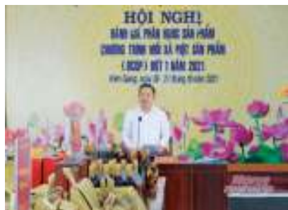
OCOP product evaluation and classification council of Kien Giang province