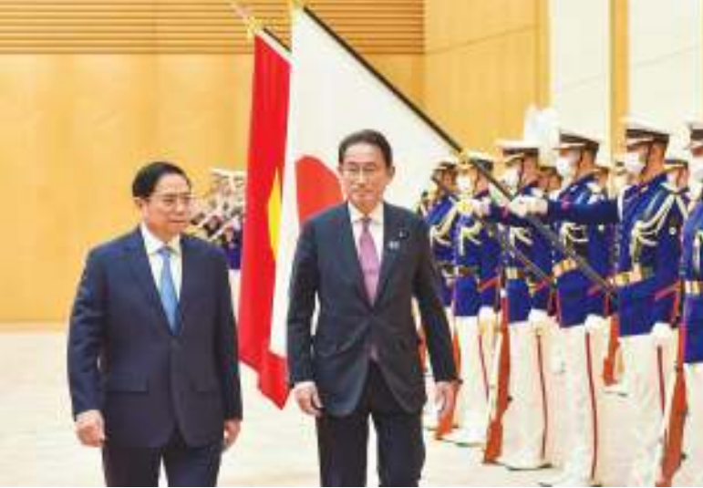
Prime Minister Pham Minh Chinh (L) and Japanese Prime Minister Kishida Fumio review the Guards of Honour during his official visit to Japan in late November 2021