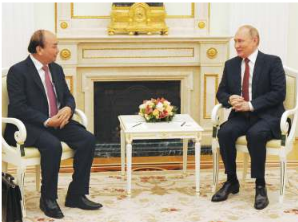
President Nguyen Xuan Phuc (L) affirmed that Vietnam always treasures its comprehensive strategic partnership with Russia during his talks with Russian President Vladimir Putin in Moscow on November 30

At the 31st Diplomatic Conference recently held in Hanoi, Minister of Foreign Affairs Bui Thanh Son emphasized that Vietnam should create a new transformation in diplomacy.