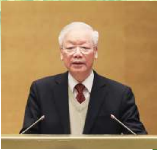
Party General Secretary Nguyen Phu Trong addresses the National Conference on Foreign Affairs