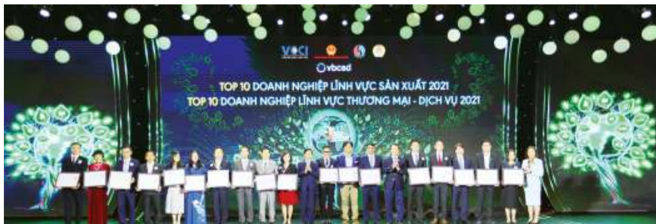
Many CSI winners are leaders in delivering the circular economy

Furthermore, VBCSD/VCCI is also actively coordinating with its members, domestic and international partners to carry