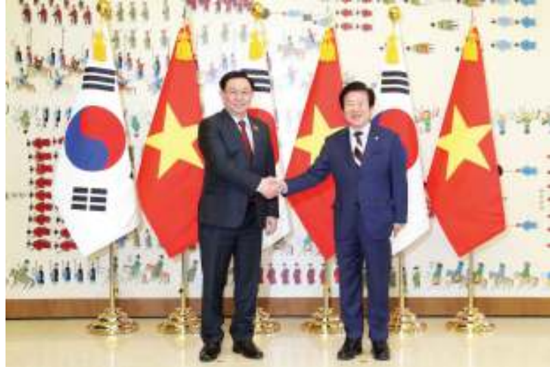
National Assembly Chairman Vuong Dinh Hue (L) emphasized that Vietnam attached importance to the relationship with the Republic of Korea during the recent talks with his Korean Counterpart Park Byeong-seug

opportunity, potential, position and international prestige that our country has never had before; thereby, contributing to strengthening the people's pride, trust and consensus on the leadership of the Party and State and the renovation, industrialization and modernization of our country.