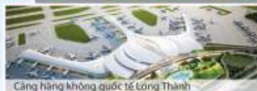
Cảng hàng không quốc tế Long Thành