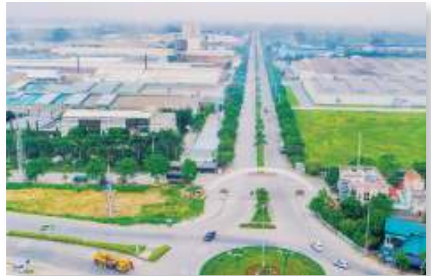
The industrial park has synchronous modern infrastructure and an environment-friendly environment

In 2014, Fuchuan Co., Ltd. was approved by the Vinh Phuc Provincial People's Committee to invest nearly US$150 million in the first-phase of Binh Xuyen II Industrial Park, covering more than 42 ha, of which rentable commercial area is over 31.6 ha. Since it launched the project, Fuchuan Co., Ltd has focused resources on the quality of technical infrastructure construction and support services for secondary investors. After one year of construction, the company completed a synchronous infrastructure system, including 126-MVA 110/35/22 kV power station, a water supply system with a daily capacity of 20,000 cubic meters, a concreted and asphalted road system for convenient freight transportation and mobility, a rainwater drainage system and a separate wastewater and solid waste treatment facility with a capacity of 1,800 cubic meters a day. Besides, secondary investors will be provided with support services in finance, banking, customs and transportation and entitled to incentive policies and maximum support of Vinh Phuc province.