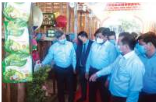
Delegates visit the booths introducing local OCOP products

With the participation of the whole political system and the efforts of businesses, cooperatives, and people, up to now, the One Commune One Product (OCOP) Program in Kien Giang province has obtained very encouraging results, becoming a far-reaching movement and a driving force for rural development. The province has innovatively and effectively adopted many good models, contributing to enhancing the province's strong products in both quality and quantity. The added value of the product has also been significantly improved, and the local people's income and quality of life have been increasingly improved.