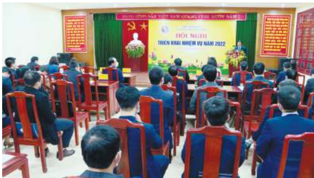
Conference on tasks of Provincial Department of Natural Resources and Environment in 2022