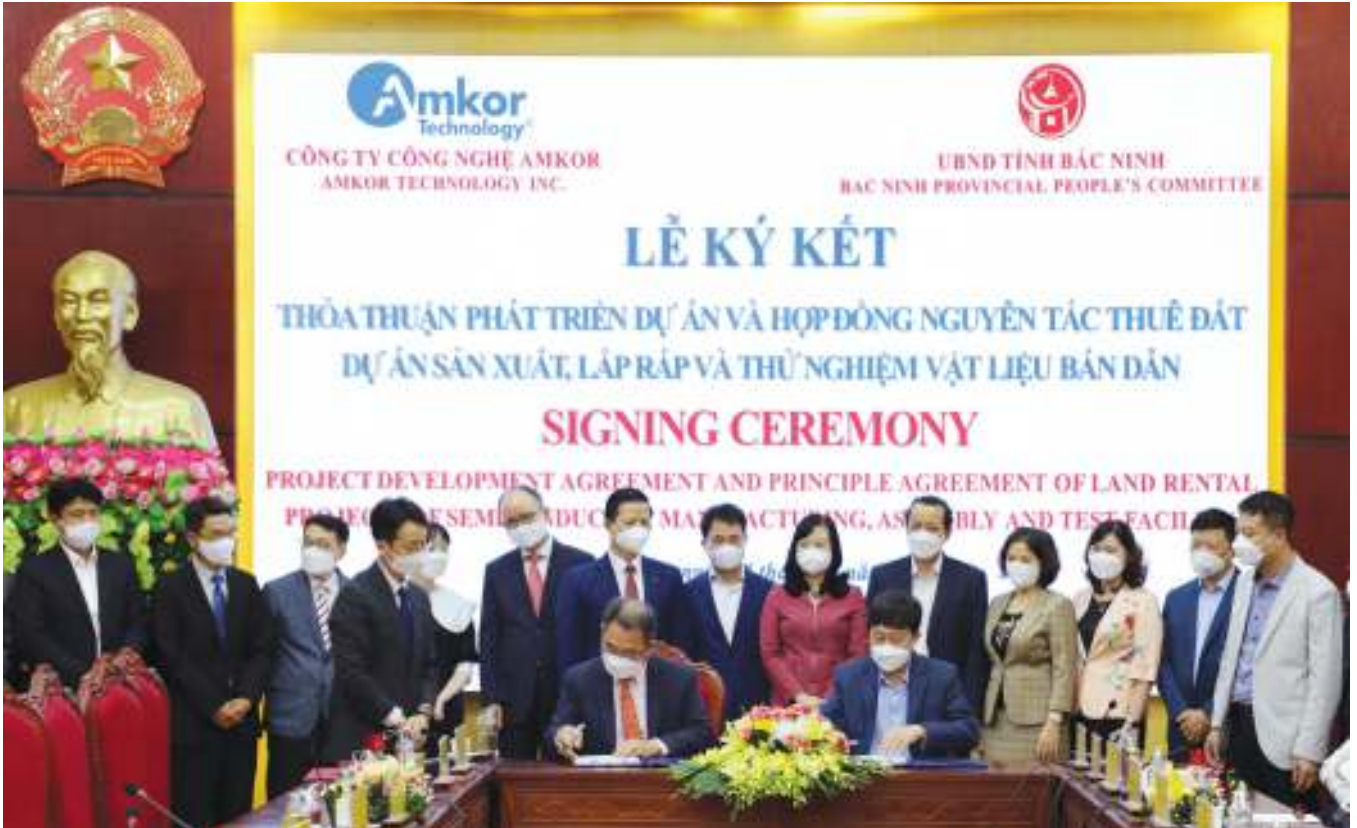
Korea's Amkor Technology Inc. signs a cooperation deal with Bac Ninh province to embark on a plant to manufacture semiconductor products