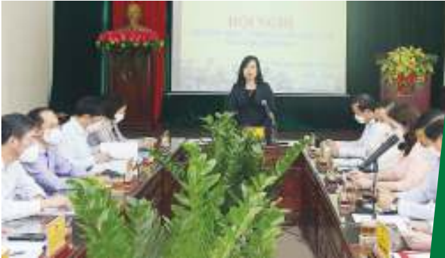
Ms. Dao Hong Lan, Secretary of the Bac Ninh Provincial Party Committee, addresses the meeting with the Department of Industry and Trade

Despite being affected by the complicatedly developed COVID-19 pandemic, Bac Ninh province achieved optimistic results in industry and trade in 2021, featuring the industrial production growth index of 9.67% and merchandise export growth of 15.7% (highest in the nation). This is an important driving force for the sector to keep going up in 2022.