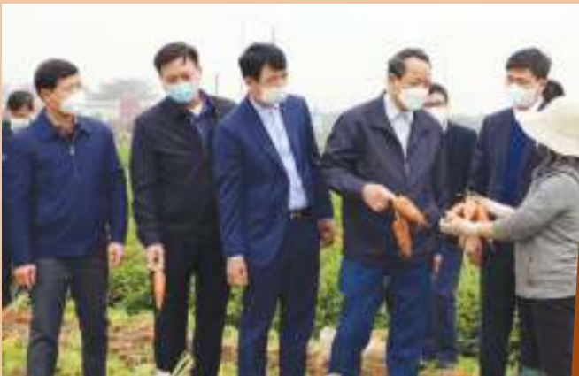
Provincial authorities inspect agricultural production in Luong Tai district

The year 2021 elapsed amid difficulties caused by the COVID-19 pandemic. In the context of complicated pandemic development, Luong Tai district of Bac Ninh province continued to realize the dual goal of effectively preventing the COVID-19 pandemic and restoring manufacturing, business and socioeconomic development.