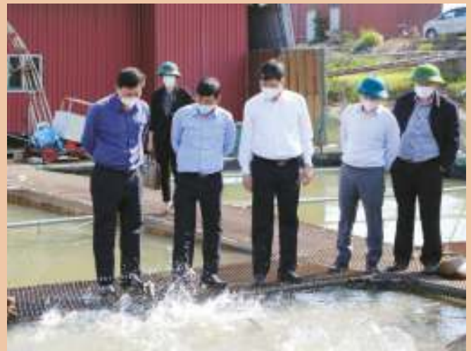
Local authorities at a working visit to Luong Tai district

requirements of the new period. The district will actively carry out the Project on industry and handicraft development in 2020-2025; build infrastructure for Lam Binh Industrial Complex and establish Quang Bo