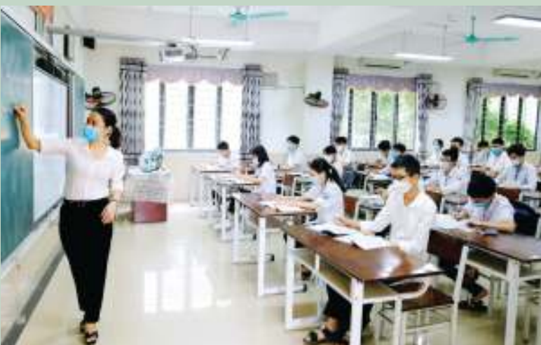
A lesson amid COVID-19 pandemic at Ly Nhan Tong High School