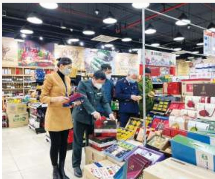
Competent authorities conduct an inspection of food safety in a business establishment