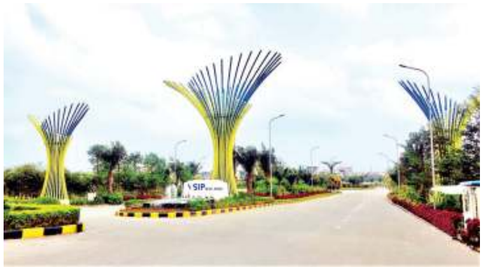
Vietnam-Singapore Industrial Park in Tu Son city

Besides, the city has firmly and effectively contained the COVID-19 pandemic; built urban public works such as cultural centers; upgraded the headquarters of the City Party Committee and the City People's Committee; invested in traffic routes and social infrastructure works such as schools and cultural houses to raise people's life and spirit. The city took care of people's health and social security; maintained national defense, security, social order and safety; and concentrated and resolutely handled land violations, hence strengthening public and business trust and consensus.