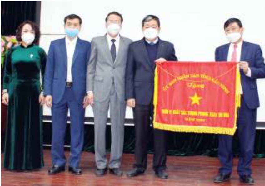
The provincial Department of Finance is honored as an excellent unit of emulation

The department will promote administrative reform in the financial sector, focusing on tax, customs, and State treasury to improve the business environment, encourage start-ups, and better serve people and businesses. ■