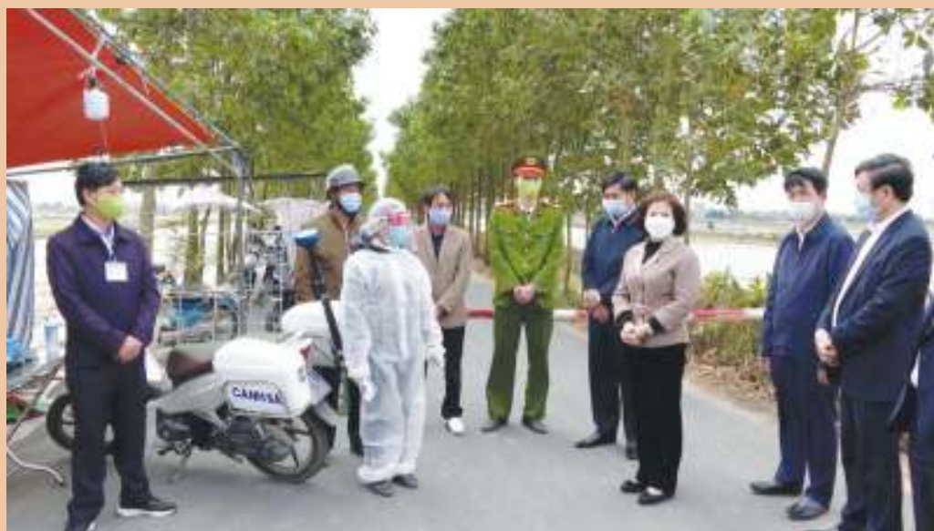
Provincial authorities inspect pandemic safety measures in Luong Tai district

The district will implement some key tasks and solutions in 2022 - the second year of executing the