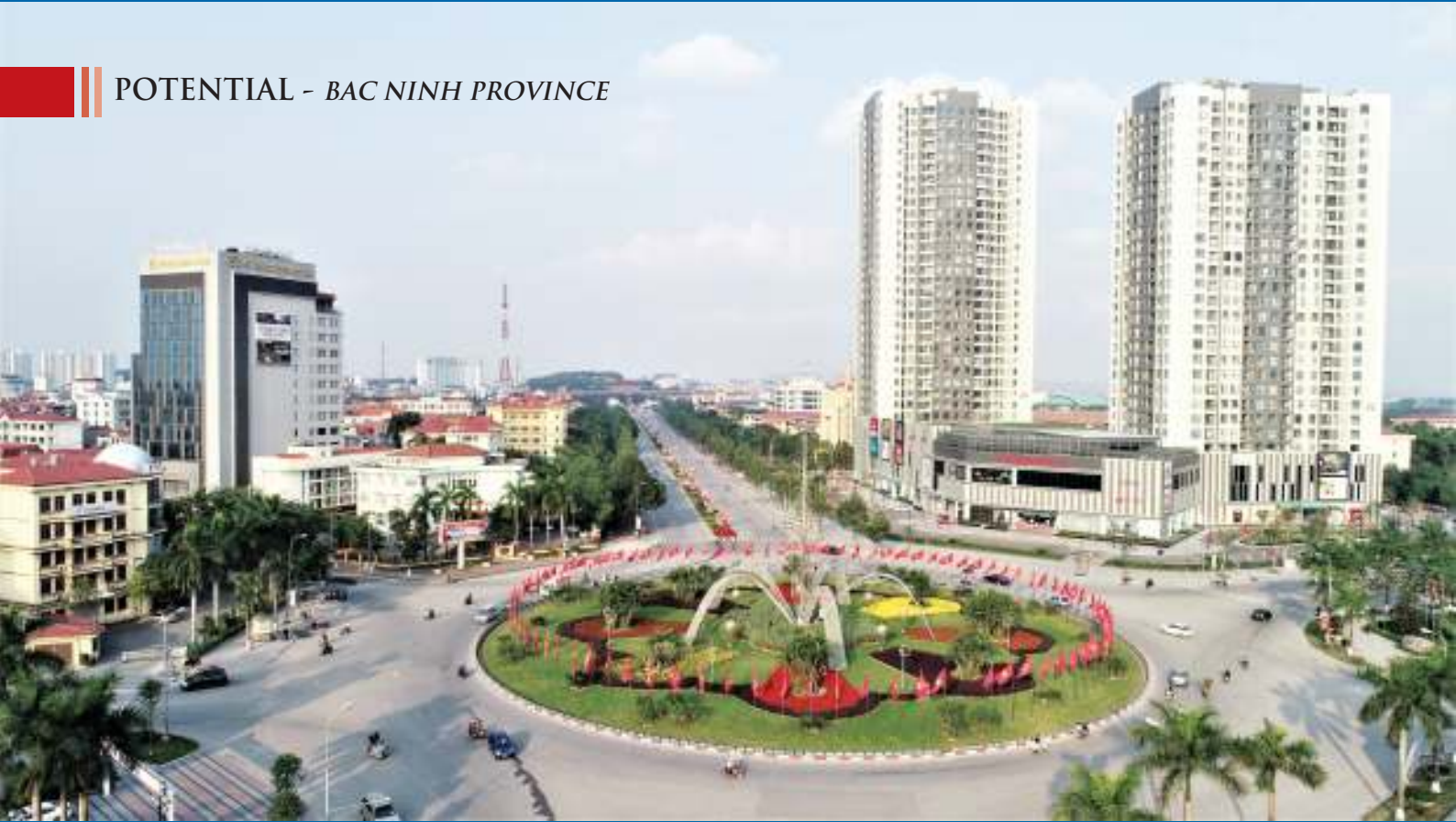
A corner of Bac Ninh City