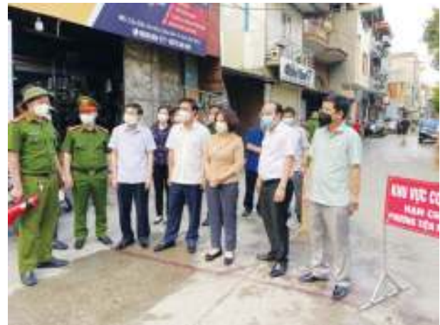
Local authorities inspect a quarantine checkpoint in Tu Son city