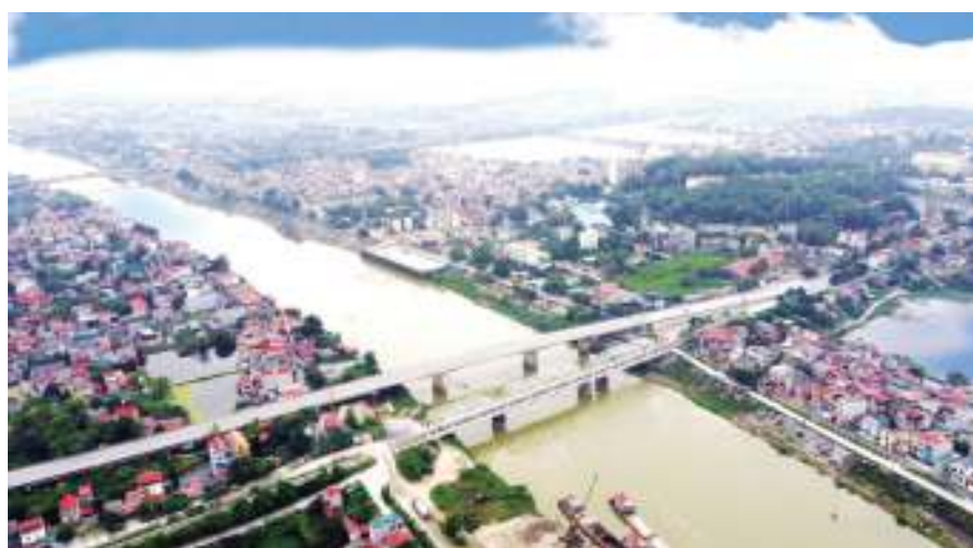
Infrastructure projects in Bac Ninh province are a driver of local economic development

282B (VND230 billion) from Provincial Road 285 to Binh Than Bridge, Gia Binh district; and extended Ly Anh Tong Road (VND166 billion) from Provincial Road 295B to Bac Ninh City.