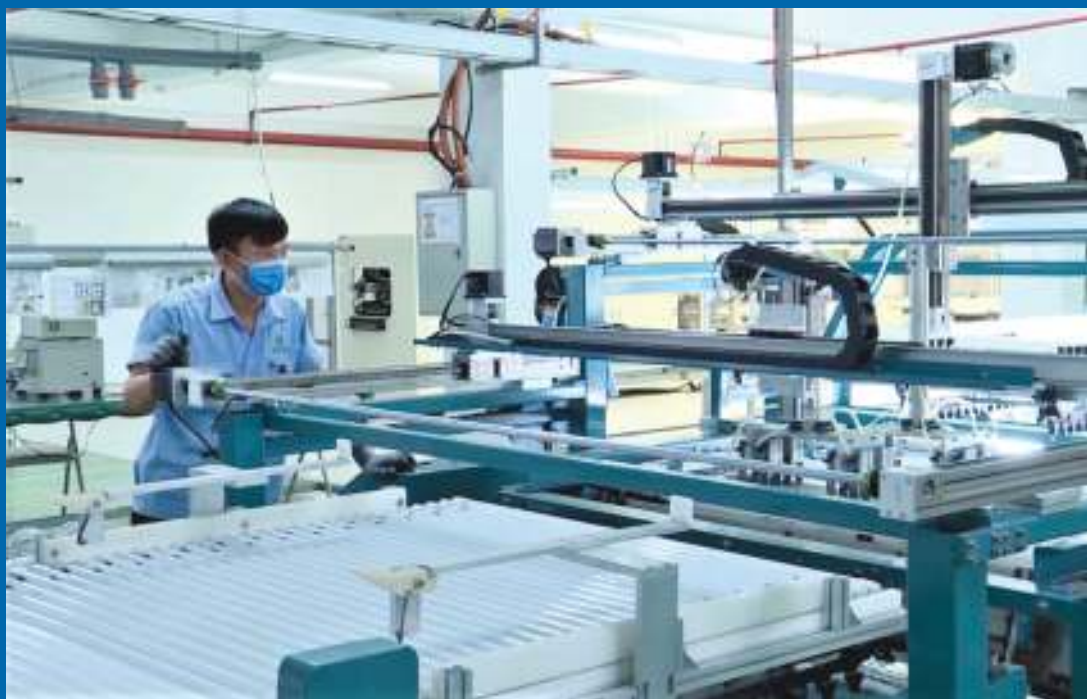
Companies make great efforts to maintain business operation

Surveys into some enterprises in industrial zones in Bac Ninh City showed that the city's government, relevant agencies and mass organizations always provided timely support for enterprises to overcome difficulties to continue production. Local enterprises, including members of Bac Ninh Young Entrepreneurs Association, actively participated in voluntary activities and joined with the city in the fight against the COVID-19 pandemic. The city funded over VND20 billion for medical equipment and essential goods.