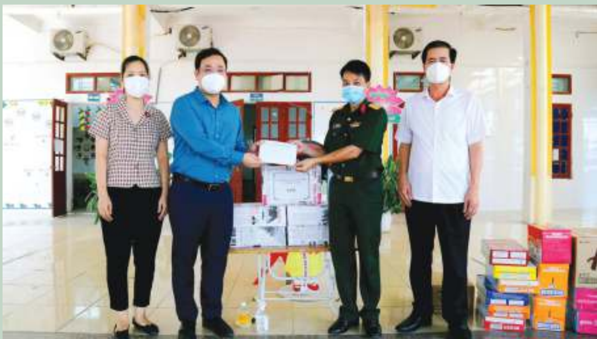
The Provincial Director of the Department of Education and Training and the Chairman of the Provincial Education Union visit and present gifts to teachers and students affected by COVID-19

In particular, we provided psychological support for students; strengthened student engagement in classrooms; coordinated with parents in managing and guiding students to