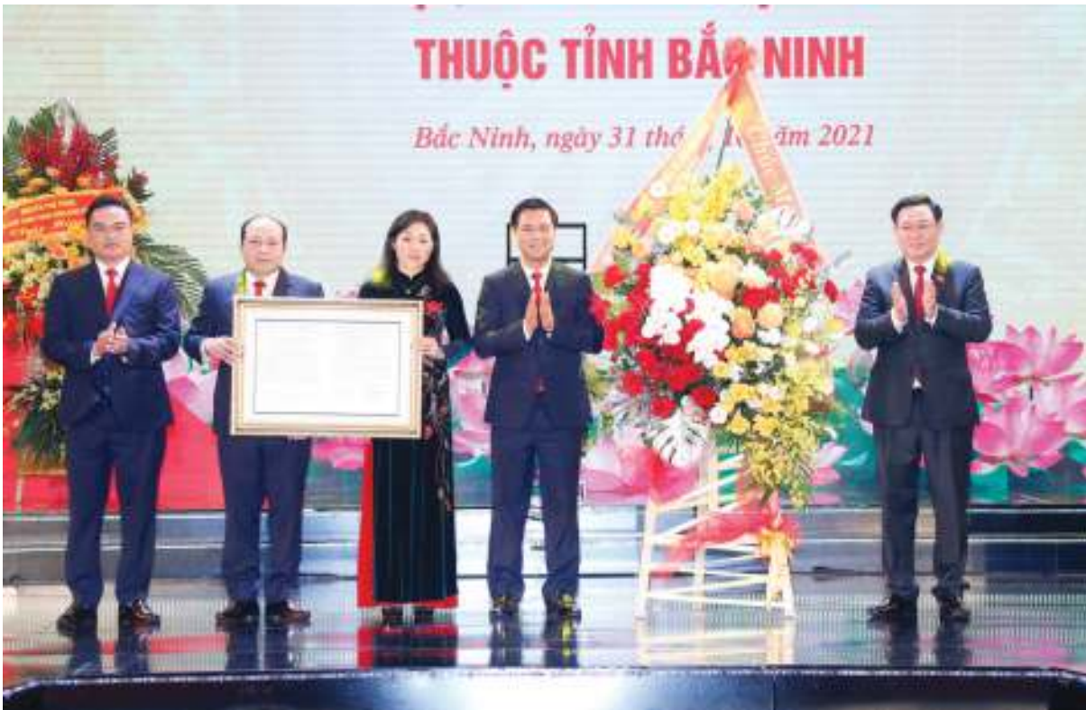
Chairman of the National Assembly Vương Đình Huệ ( R ) hands over the Resolution on the establishment of Tu Son city