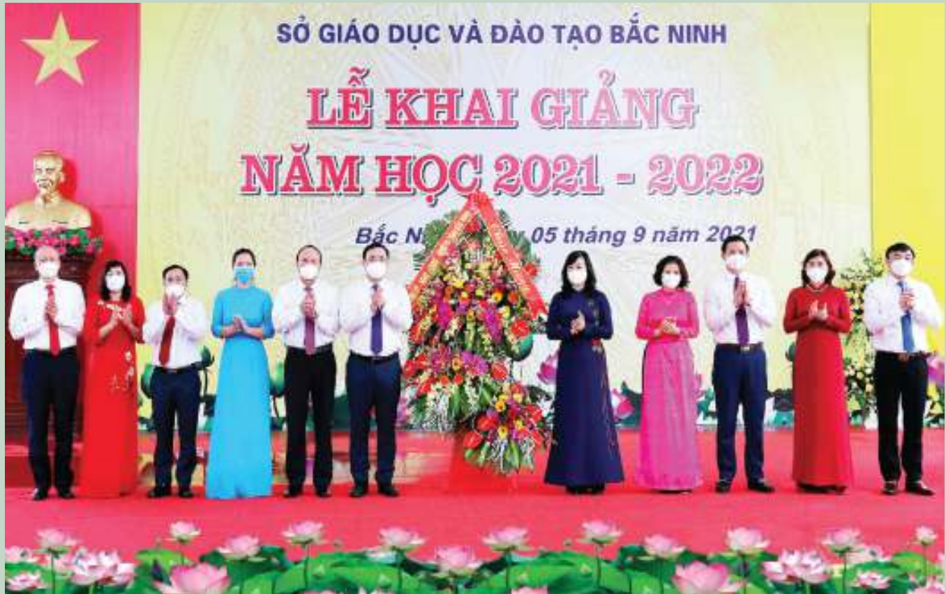
The opening ceremony for the 2021-2022 school year in Bac Ninh province