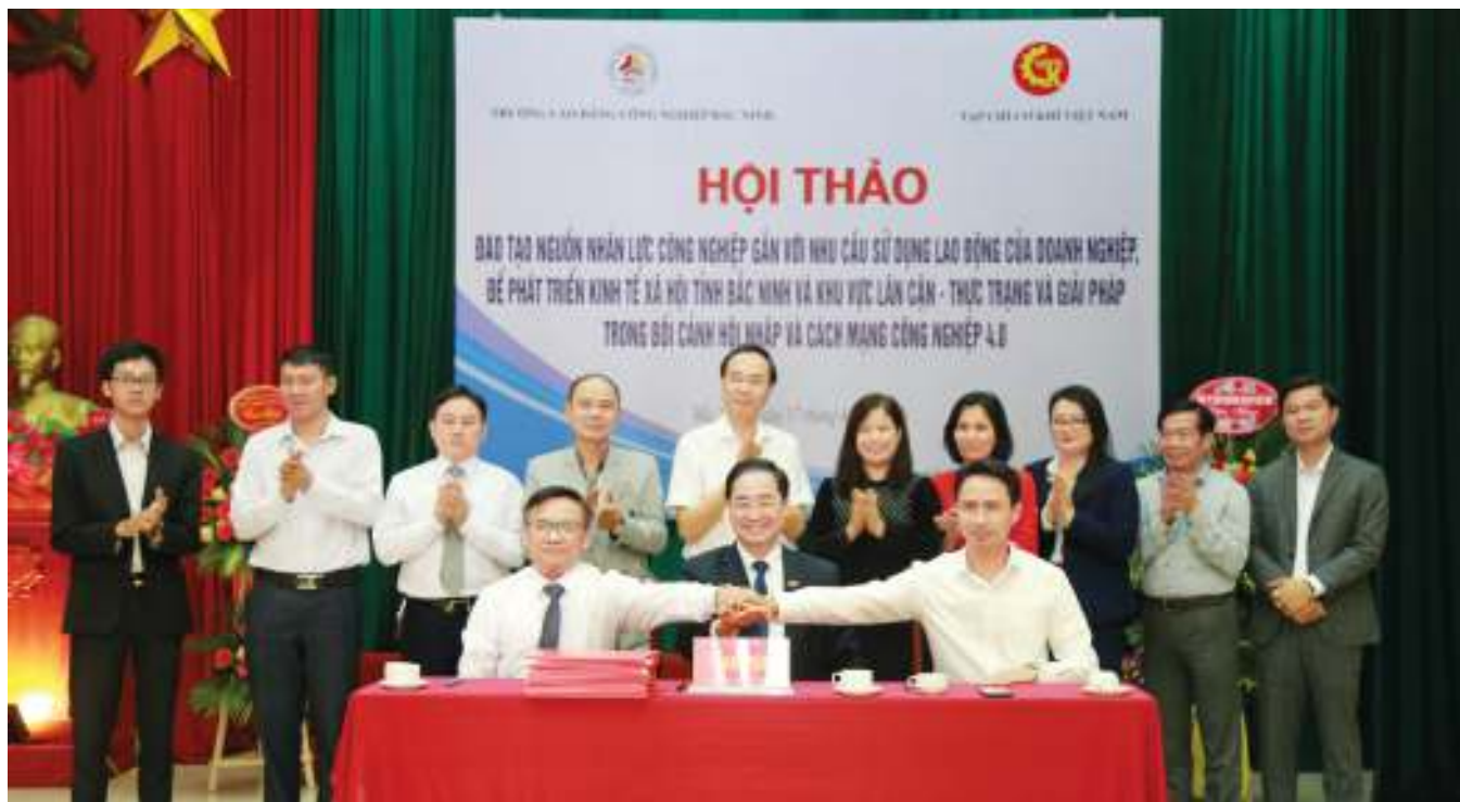
Bac Ninh College of Industry signs a cooperation agreement with its partners

Promoting the achievements, in the coming time, the College will actively plan and organize "dual training" activities, and complete the development of training programs according to vocational education innovation associated with employers. It will maintain and increase the scale of formal training, especially at the College level. It will strengthen facilities, foster and develop the quality of lecturers and administrators according to the roadmap of the High-Quality School Project. The College will update new technologies, continuing to strongly digitalize major activities of the school, effectively organize research activities and science application