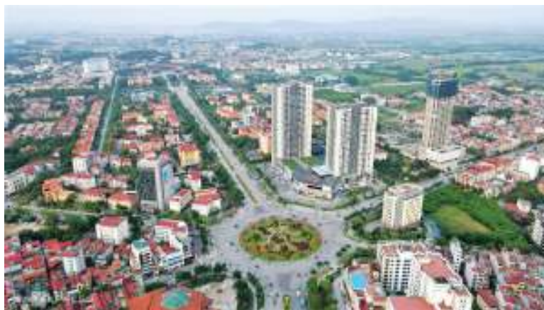
A corner of intersection, Dai Phuc ward, Bac Ninh city, one of the axis connecting traffic and urban development of the province

Besides, the province has promoted structural transformation, developed high-tech industries, supported industries, increased science and technology content and raised the proportion of prices localization value in the product.