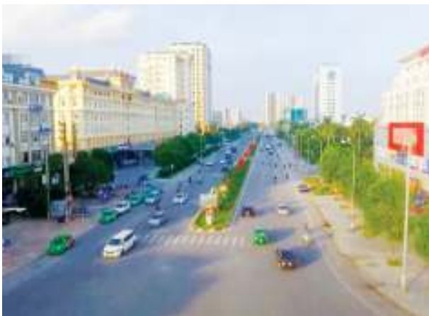
A corner of Tu Son city