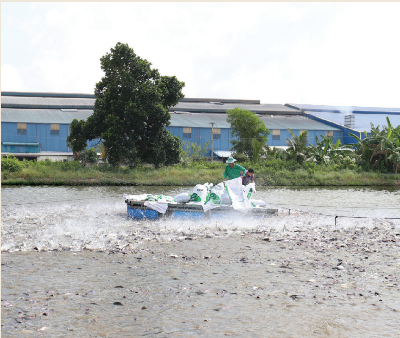
Tra fish farming at Thang Loi cooperative, Vinh Binh commune

“The district will continue to hold regular meetings, dialogues and exchanges with enterprises to promptly grasp their difficulties, helping them invest in stable business and development. Vinh Thanh will apply preferential and incentive policies for enterprises to upgrade equipment and machinery and transfer new technologies,” he affirmed. ■