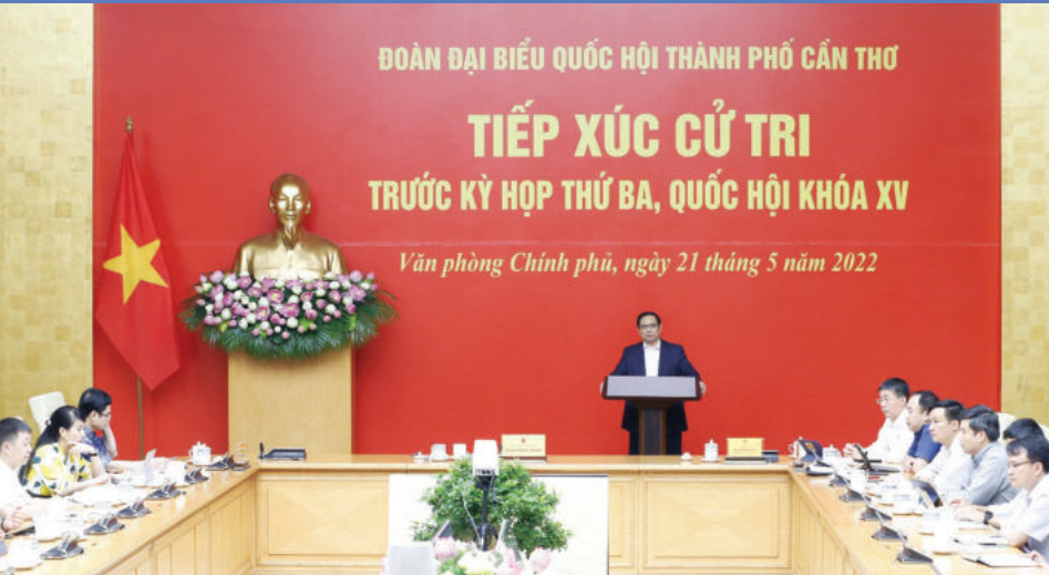
Prime Minister Pham Minh Chinh at an online meeting with voters of Can Tho city

S pecifically, in 2022, Can Tho city strives to achieve a total state budget revenue of VND11,117 billion. VND10,617 billion comes from domestic revenue, VND500 billion from customs tax collection. The total local budget expenditure is estimated at VND15,328 billion. To achieve the set goals, the city has been implementing synchronous solutions such as focusing on solutions to production and business recovery; firmly directing to strictly implement the Law on Tax Administration, fighting against the loss of revenue, combating transfer pricing, tax evasion, and commercial fraud; strengthening debt management and tax debt recovery. The city also continues to promote tax administrative reform, strengthen the application of information technology in tax administration; regularly monitor, check and control the tax declaration of organizations and individuals.