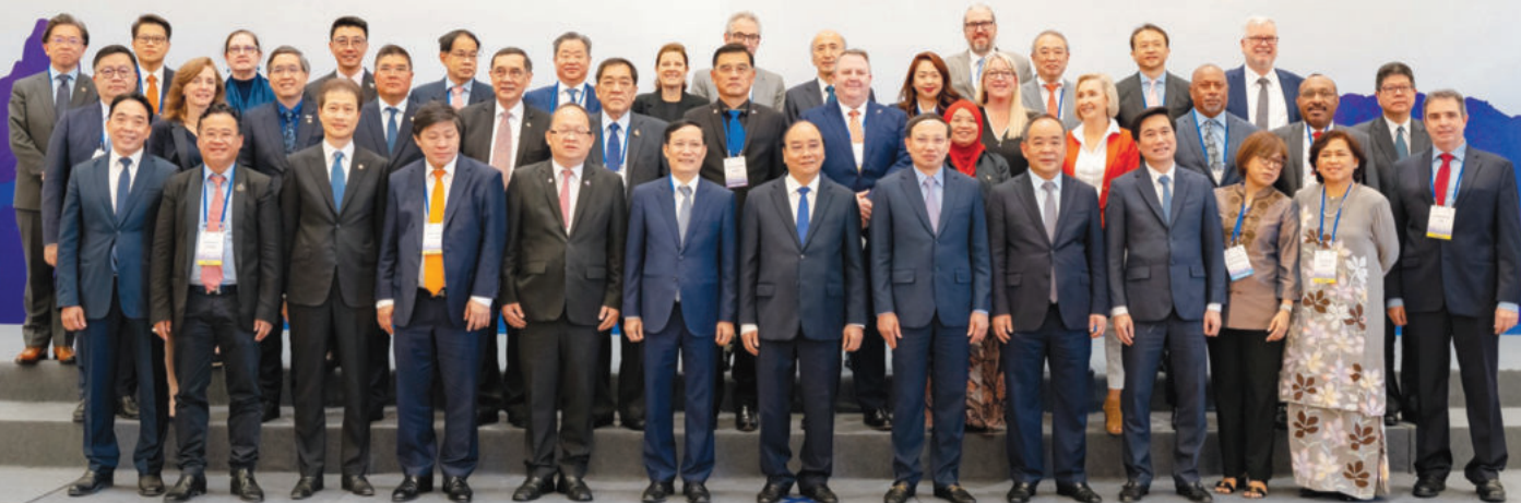
President Nguyen Xuan Phuc and delegates attending ABAC 3 Meeting