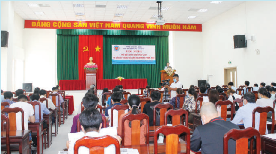
Can Tho Customs Department organizes many programs to support businesses

Speeding up reform and modernizing the customs sector is a key strategic task of Can Tho Customs Department, helping it successfully accomplish its tasks and support local economic development and integration.