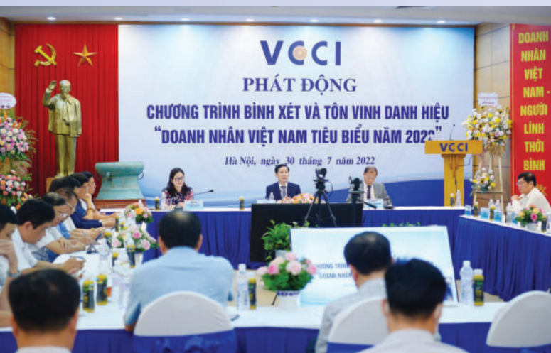
The kick-off ceremony of the Outstanding Vietnamese Entrepreneurs 2022

The program to vote for Outstanding Vietnamese Entrepreneurs 2022 has many innovations in terms of regulations and voting criteria. It emphasizes transparency in the review process.