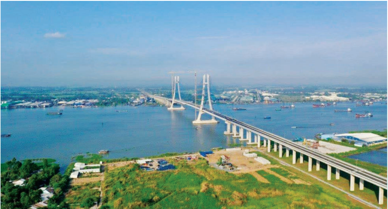
Vam Cong Bridge crosses the Hau River, connecting Thot Not district in Can Tho city and Lap Vo district in Dong Thap province

Thot Not will prioritize trade, service and tourism investment. However, the district will focus on developing key industrial sectors and fields; utilize local advantages for development and implementing key projects; and build synchronous transport infrastructure for socioeconomic development.