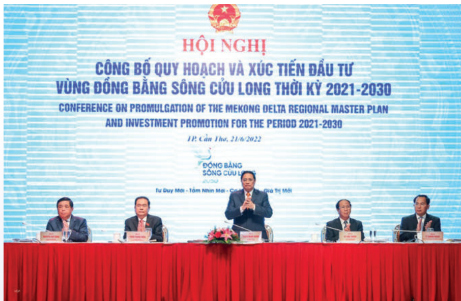
Prime Minister Pham Minh Chinh at the conference to announce the Master Plan and investment promotion program for the Mekong Delta in the 2021-2030 period

There are many obstacles in policy mechanisms, growth patterns and strategic infrastructure (transport, urban and digital) in realizing the goal of developing Can Tho City into "a center of industry,