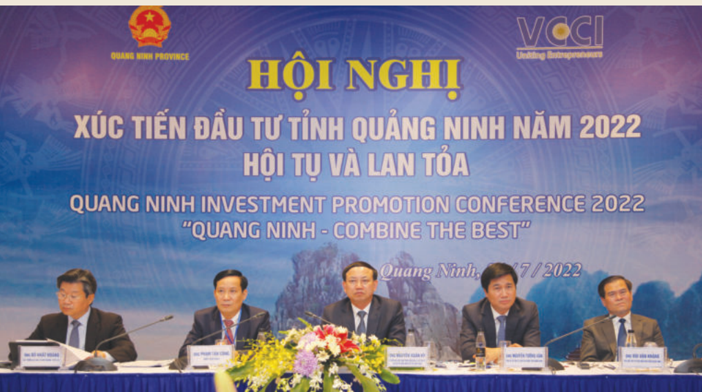
Quang Ninh provincial leaders vow to best support investors at the Investment Promotion Conference

Quang Ninh is always among the best economic performers in the country. Despite the huge impacts caused by the COVID-19 pandemic, Quang Ninh still excelled, with double-digit growth of 10.66% in the first six months of 2022. Besides, the province has maintained this high growth rate of over 10% for six straight years, from 2016 to 2021. The quality of economic growth has improved significantly and the scale and potential of its economy has increased markedly. Its GRDP per capita reached over US$7,000 in 2021, more than twice the national average.