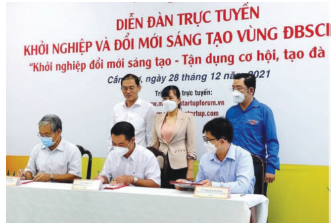
Forum on Start-ups and Creative Innovation in the Mekong Delta

According to the plan, the city strives to have 18,000 small and medium-sized enterprises by 2025. over 80% of them will apply information technology, digital technology and digital solutions and over 30% of the enterprises will involve innovative operations. In the period 2026-2030, the scale and competitiveness of enterprises will be improved. The city will consolidate and upgrade existing models of centralized and production linkages to develop into clusters of industry