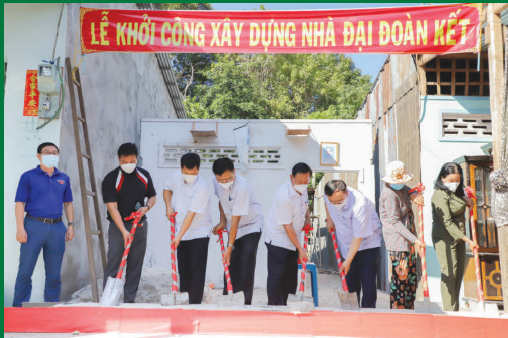
Leaders of EVNGENCO2 start construction of charity houses for local people

releasing fish to regenerate aquatic resources in hydropower reservoirs; planting trees to cover bare land and bare hills and protect the land; launching cycling movements to inform and motivate consumers to turn off unnecessary lights and electrical equipment in response to the “Earth Hour” campaign; organizing “Bright - Green - Clean - Nice” movements and “Green Saturday” movements to preserve the natural environment.