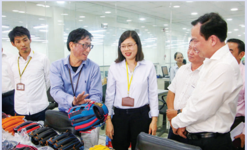
Leaders of Can Tho city pay a working visit to a company in Tra Noc Industrial Park

We have concentrated on speeding up the Can Tho City development planning in 2021 - 2030, with a vision to 2050. We have held meetings with relevant agencies and districts; closely coordinated