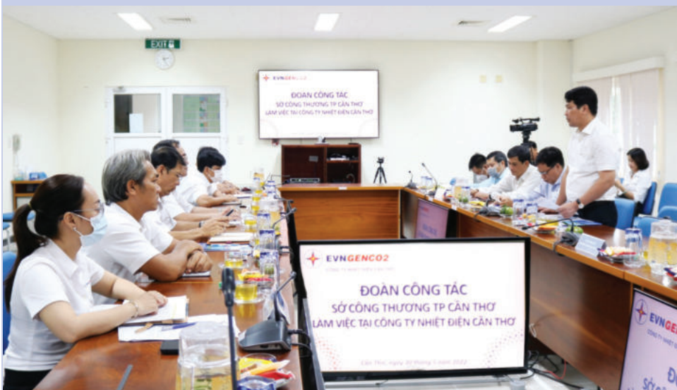
The delegation of Can Tho City Department of Industry and Trade at a working session with Can Tho Thermal Power Company

Can Tho City has been fostering flexible, creative and suitable solutions in the new context. In particular, the industry and trade sector is further improving efficiency and supporting businesses to make a post-pandemic recovery.