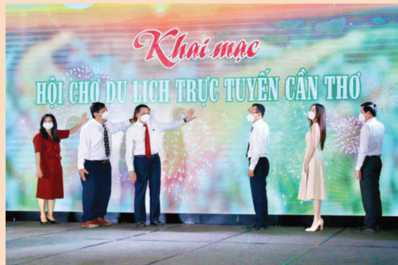
The opening ceremony of the Can Tho Online Tourism Fair

Currently, many digital transformation models such as the City Tourism Portal at https://canthotourism.vn and http://mycantho.vn have been put into operation and are increasingly being upgraded and completed. Besides, there are technology solutions for tourism management and administration, and tourism promotion.