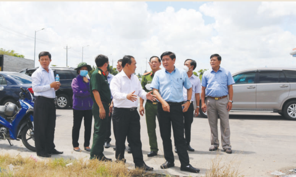
Local leaders at working visit to an industrial park

Vinh Thanh has focused on developing a modern countryside according to advanced criteria and attracting investment capital for rapid development of industry, handicrafts, trade and service. The district has strived to have a total production value of VND46,490 billion in the 2021-2025 period, achieve an annual budget growth of at least 12%; and reduce the poverty rate to less than 0.5%.