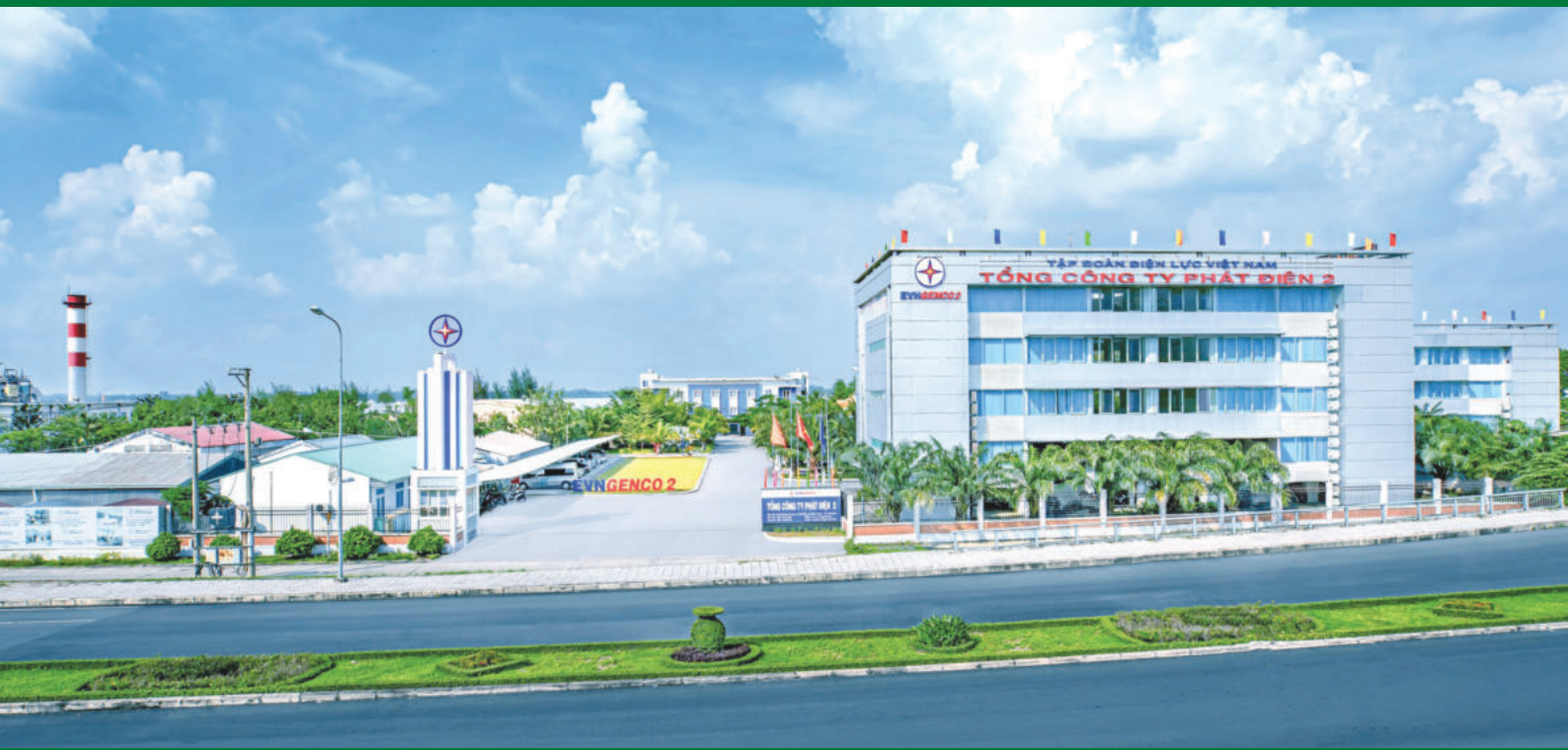
EVNGENCO2 Headquarters in Can Tho City