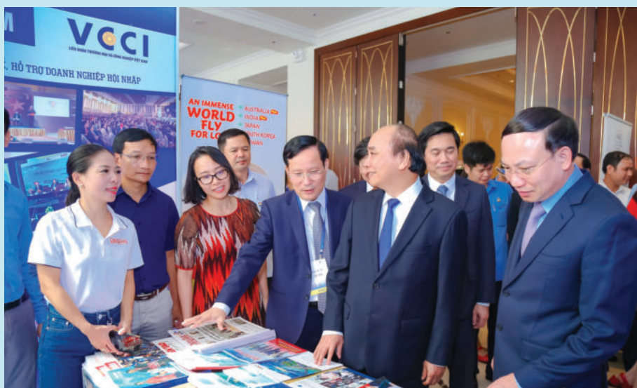
On the sidelines of ABAC 3, President Nguyen Xuan Phuc and delegates visit the VCCI's media booth

In his welcome speech, President Phuc appreciated ABAC for opening the third meeting of this year in Ha Long to bolster APEC private cooperation and work together to find ways to make a business recovery, foster trade and